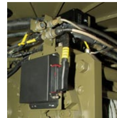
TREIBMATIC TR 200/6